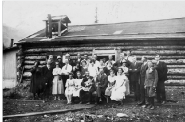
The community gathers for a summer party in 1926.

On March 19, 1932, President Herbert Hoover signed an act expanding the park, moving the eastern boundary to the "natural boundary" of the Nenana River. The move placed the entire community within park boundaries. Conservationists hailed the extension as a long overdue move to protect the eastern boundary of the park, as well as sheep and caribou herds. Local residents viewed the changes with dismay because many cabins were without title and some claimed land was immediately in dispute. With the expansion, McKinley Station as a viable community came to an end.