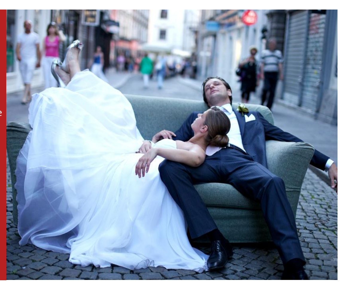
BEST WESTERN PREMIER HOTEL Slon is only a few steps away from the Ljubljana castle and Townhouse.

The narrow, paved lanes of Ljubljana are one of the most romantic locations for a stroll of the newlyweds.