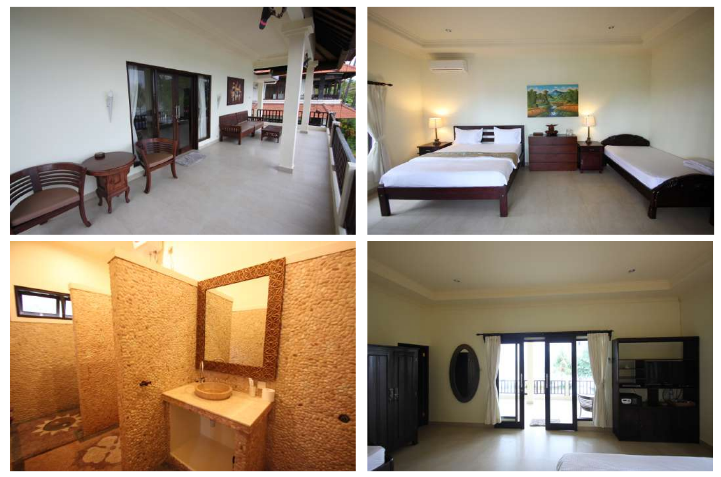
2-bdroom Garden-view villa with kitchen (50m from the main territory)