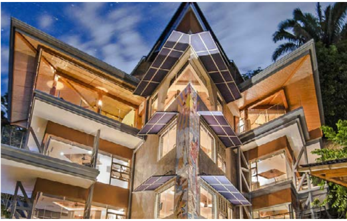
“Rainforest Meets the Sea” - Manuel Antonio, Costa Rica 3RD HOME Property ID: 5614 10 Bedroom Estate with 6 levels