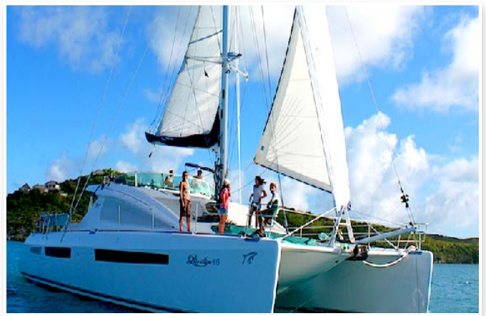
Tradewinds 62 ft Yacht - St. Maarten Sailing Vacation 3RD HOME Property ID: 7755 4 Cabins, Sleeps 8