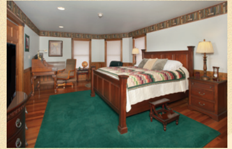
The Scholars Corner