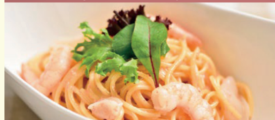
Edelweiss Sandwiches Hours:11:00-17:30(LD) Spaghetti with Seasoned Cod Roe Sauce JPY900