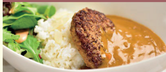
Edelweiss Sandwiches Hours:11:00-17:30(LD) Hamburger Steak with Curry and Rice JPY980