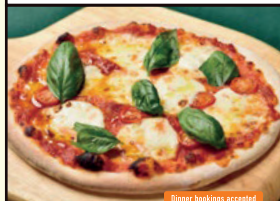
Dinner bookings accepted

Hours and Period : Breakfast Opening period is irregular. Dinner 17:00-21:30 (12/22-3/23) Location : North Wing 4F