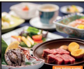
Dinner bookings accepted