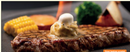
Dinner bookings accepted