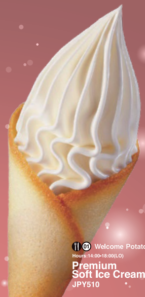
Welcome Potato Hours:14:00-18:00(LD) Premium Soft Ice Cream JPY510