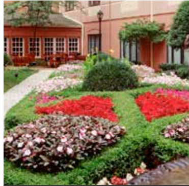
Courtyard Garden Inn at Henderson's Wharf