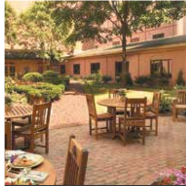
Courtyard Garden Inn at Henderson's Wharf