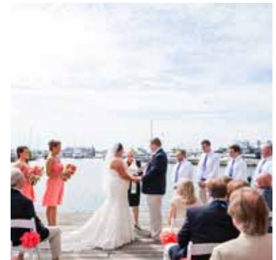
Outdoor Promenade Inn at Henderson's Wharf