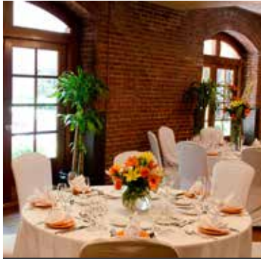
The Gallery Inn at Henderson's Wharf

Blog: www.TravelGuideBaltimore.com Twitter: @HendersonsWharf Facebook: facebook.com/hendersonswharf