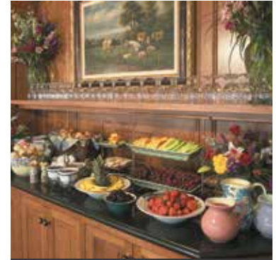
Continental Breakfast Inn at Henderson's Wharf