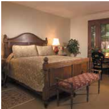
Guest Rooms & Suites Inn at Henderson's Wharf