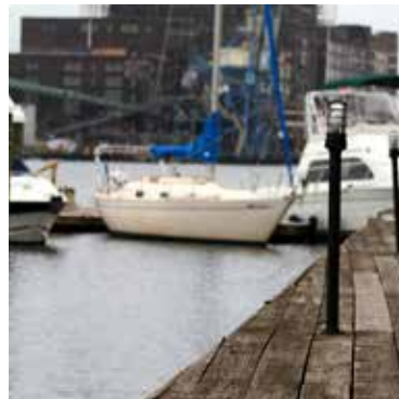
Marina & Waterfront Promenade Inn at Henderson's Wharf