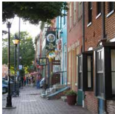
Fell's Point Inn at Henderson's Wharf