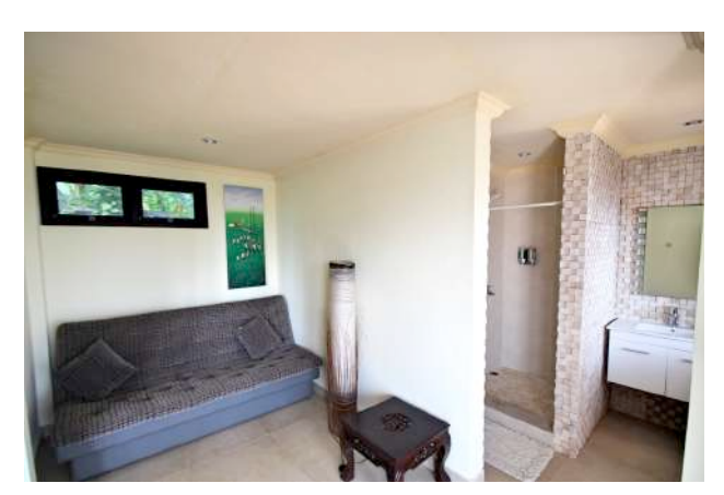
Double Room on the upper floor