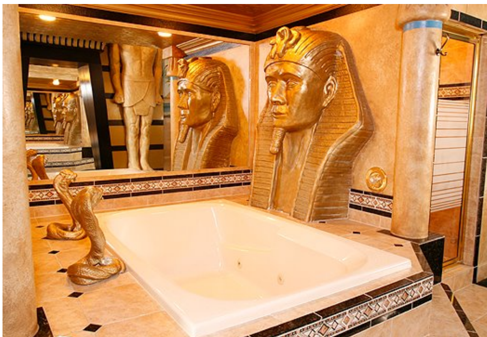
Black Swan Inn

Built in 1933 and transformed into the realization of two couples' dreams, the Black Swan Inn's Tudor and gardenlike exterior is only a taste of its interior charms. With 15 themed suites ranging from Egyptian and Moroccan to Underwater, there's a cozy destination retreat to fit every taste and romantic occasion. Here, you will be charmed with all the elegance and details of a pricey overseas vacation, with all the conveniences of one of Southeast Idaho's largest cities.