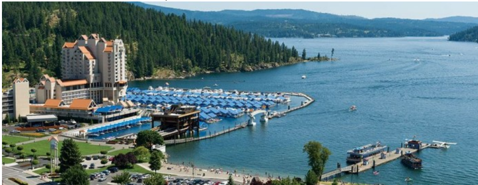
The Coeur d'Alene Resort