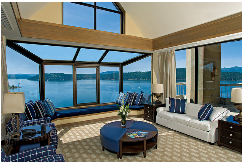
The Coeur d'Alene Resort

This resort was hailed by U.S. News & World Report as Idaho's top hotel, and nationally ranked in the top 20 Northwest getaways. One glimpse of this luxury resort's panoramic lakeside views, lush tower suites with wall-to-wall windows and majestic fireplaces, and its scenic floating golf course will be enough to make you want to drop everything and move in. The CDA Resort is undoubtedly the pinnacle of Idaho destination lodging, offering every amenity and lavish experience one could dream of, all in Northern Idaho's most beautiful waterfront setting. There was no way we couldn't include it on this list.