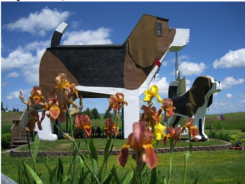
Dog Bark Park Inn