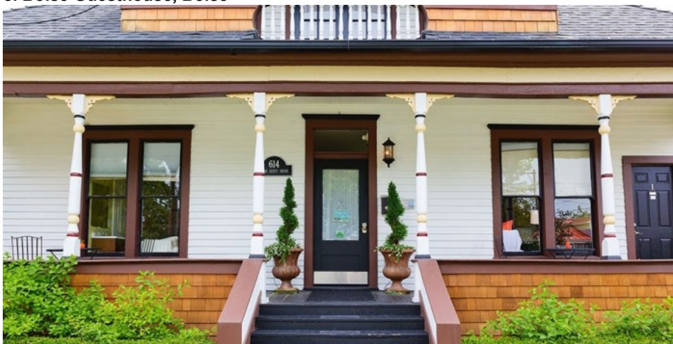
Boise Guest House