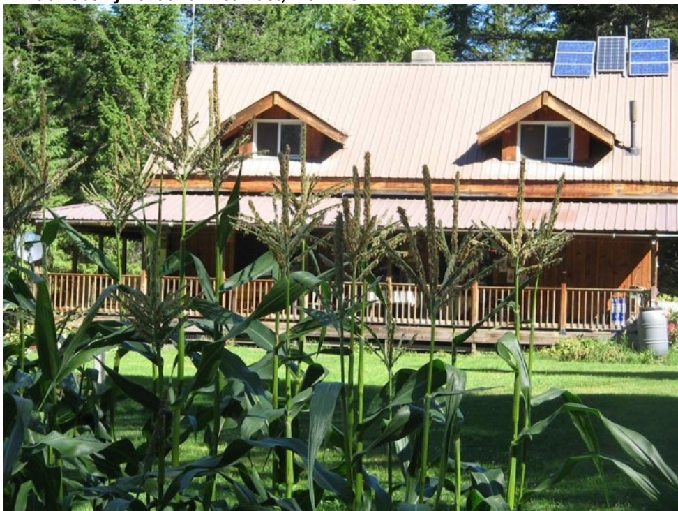
Huckleberry Tent and Breakfast/Facebook