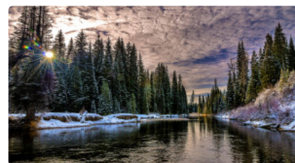
These 13 Beautiful Sunrises In Idaho Will Have You Setting Your Alarm

You've always wanted to stay in a treehouse, and these quaint, lofted cabins give travelers a taste of childhood dreams come true. Every treehouse has an outdoor kitchen below the sleeping quarters, and a large, shared community bathroom. Depending on the treehouse you choose, your cozy home away from home may come equipped with a ladder, or more accessible stairs.