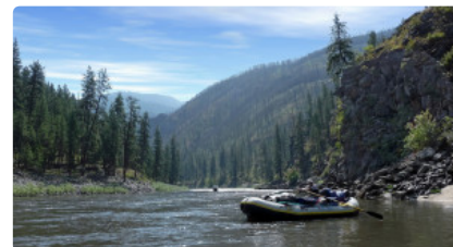
Idaho Is Number One At All Of These Things