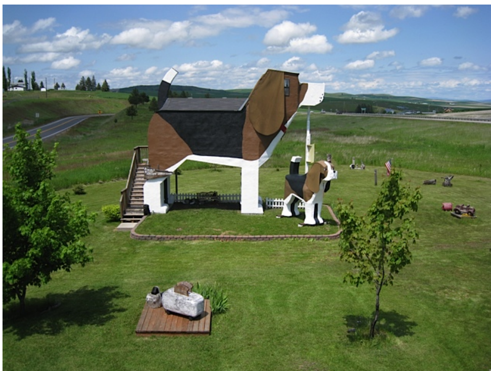
Dog Bark Park Inn