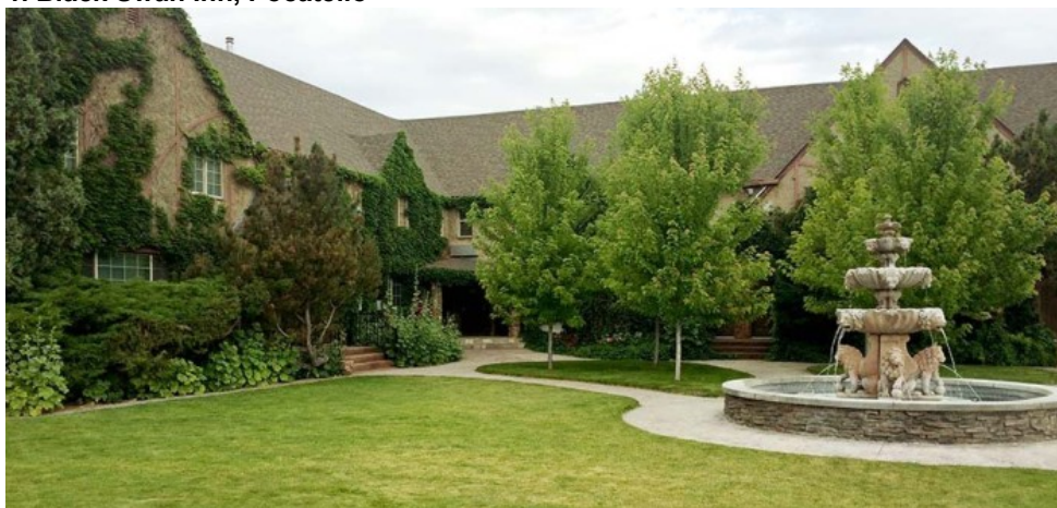
Black Swan Inn