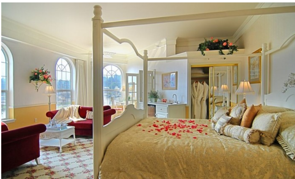
The Ashley Inn

For a cozy, yet luxurious hotel-like stay with personalized service and complimentary...everything, Ashley Inn is a beautiful and welcome Idaho gem. Oversized tubs and suites, fireplaces, a scenic setting right on Payette River, and fresh Southern charm and hospitality make this inn something truly special. And the opportunity to sleep in a turreted tower is just an added bonus.