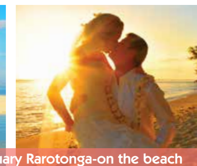
The Rarotongan Beach Resort & Spa + Sanctuary Rarotonga-on the beach