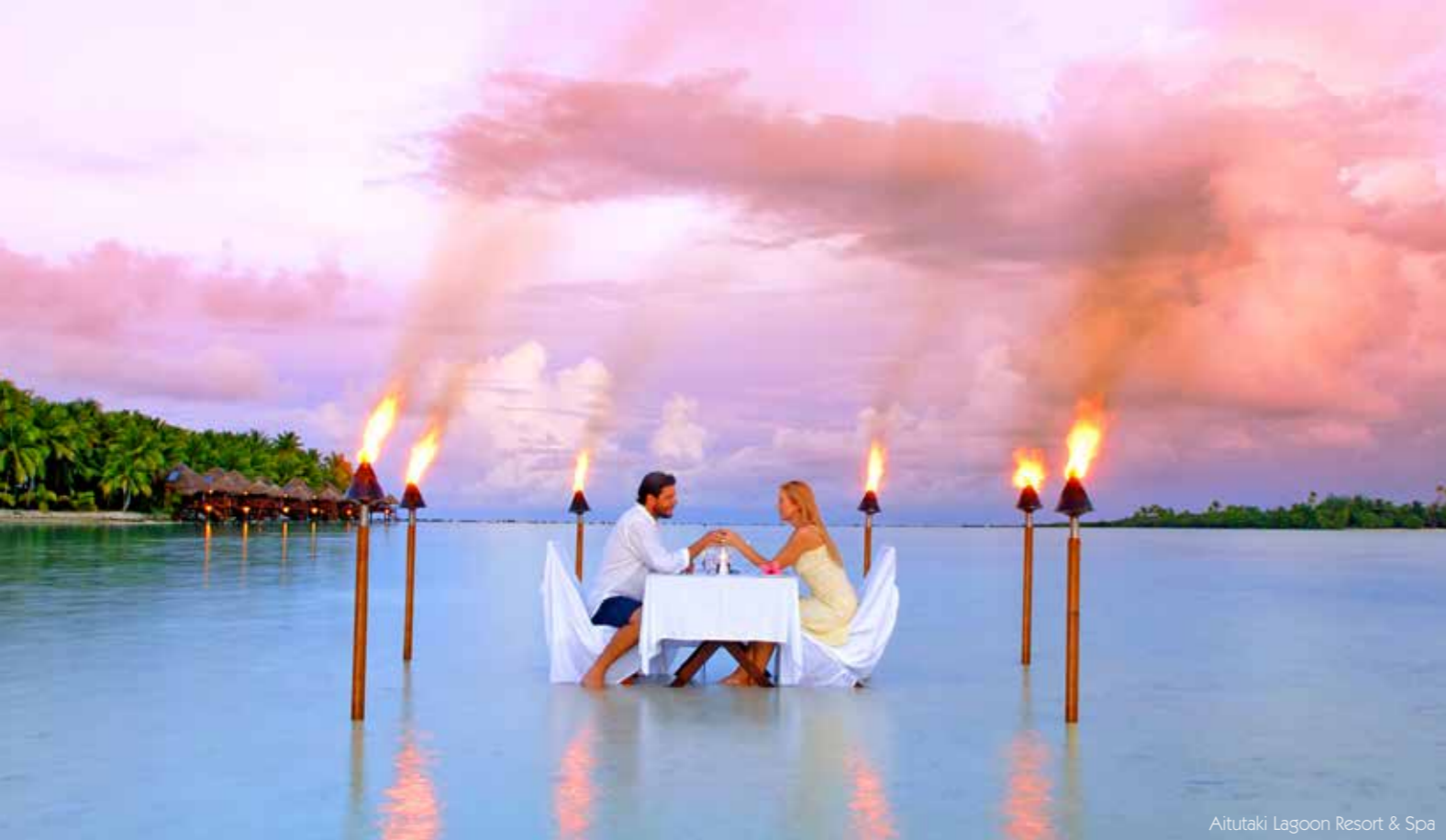
Aitutaki Lagoon Resort & Spa