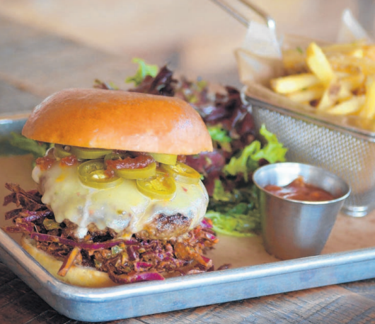
The Hotter-Than-Hell Burger at Draft Republic.

mushroom-gravy-covered Dirty Fries. Saturday. 2750 Dewey Road, Suite 104, San Diego. (619) 269-7632 or sodaandswine.com