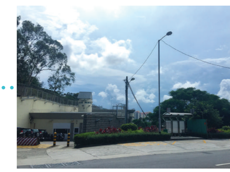
路環市區 - 警察訓練營對面 Coloane Village Opposite to the Police Training Camp