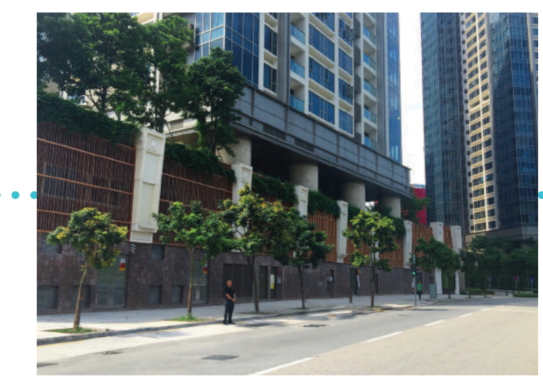
澳門大熊猫館對面 Opposite to the Macau Giant Panda Pavilion