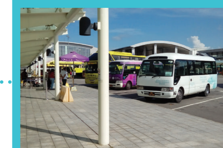
氹仔客運碼頭 - 穿梭巴士停泊區 Taipa Ferry Terminal - Shuttle Bus Parking Zone