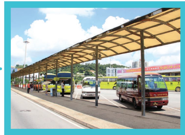
澳門外港客運碼頭 Macau Ferry Terminal