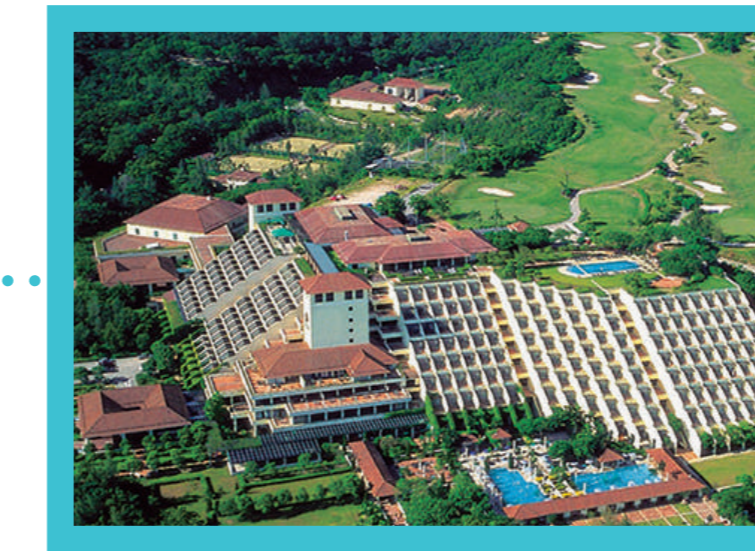
鷺環海天度假酒店 Grand Coloane Resort