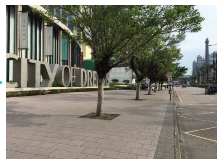
金光大道 - 新濠天地巴士站 Cotai Strip Public bus stop in front of City of Dreams