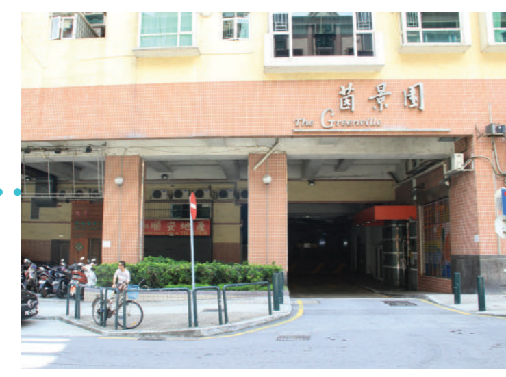
氹仔 - 茵景園私人屋苑正面 Taipa Island The Greenville Apartment