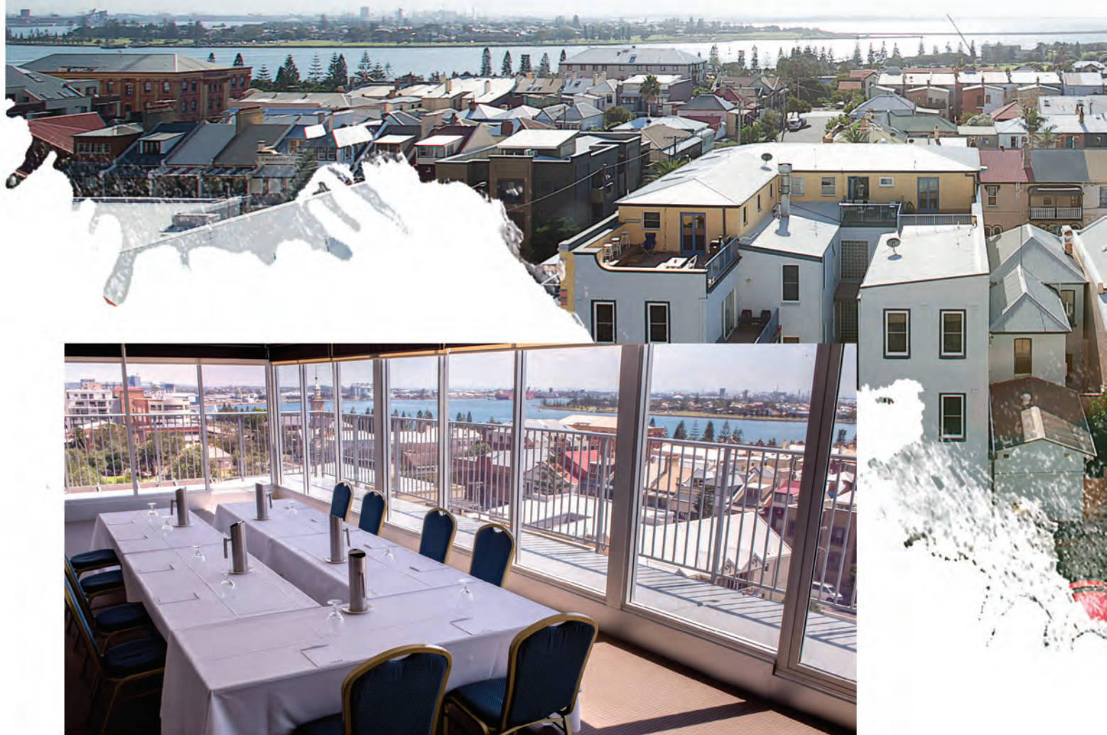
The inspirational view from Harbour View room