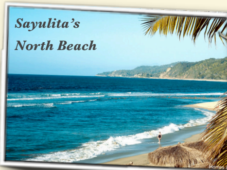
Sayulita's North Beach

and relaxing experience. Not too far is Playa Secreta , a small beach only accessible by foot when the tide is low through some natural rock caverns. Sayulita's North Beach is only 2 1/2 blocks from Los Almendros and is the best part to be if you want to be surrounded by some people but not too many, and only 4 minute walk to Main Beach. Playa Los Muertos is surrounded by Sayulitas folkloric cemetery covered by a lush jungle, popular for its giant 30 feet rocks to dive off.