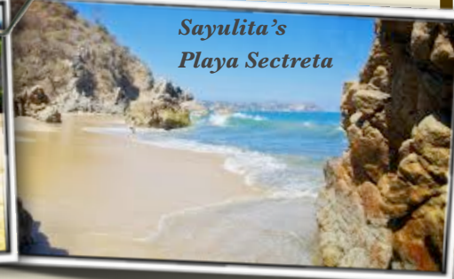
Sayulita's Playa Secreta

and relaxing experience. Not too far is Playa Secreta , a small beach only accessible by foot when the tide is low through some natural rock caverns. Sayulita's North Beach is only 2 1/2 blocks from Los Almendros and is the best part to be if you want to be surrounded by some people but not too many, and only 4 minute walk to Main Beach. Playa Los Muertos is surrounded by Sayulitas folkloric cemetery covered by a lush jungle, popular for its giant 30 feet rocks to dive off.