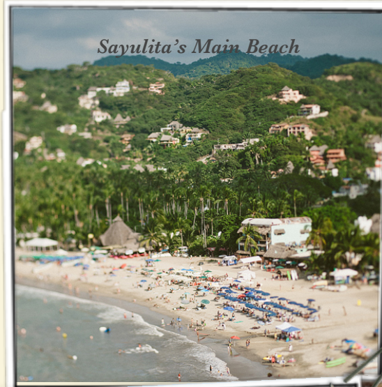
Sayulita's Main Beach

Sayulita's "Main Beach" is nestled in a peaceful palm tree-lined bay just off the center square. This is the busiest part of the beach where you can learn how to surf, paddle board, among many other activities. Other beaches, like Playa Malpasos a mile long of untouched beach with no construction, offer an unrivaled secluded