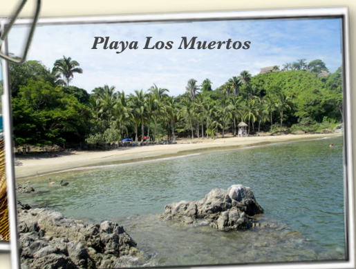
Playa Los Muertos