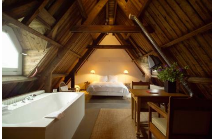
Five-star swing room, 602, 607, The Lloyd Hotel & Cultural Embassy, Amsterdam

With its austere architecture, shadowy history and docklands location, the Lloyd may seem a curious choice for a stay in Amsterdam, but the hotel's waterside setting makes it the ideal vantage point for exploring the Noord - an emerging area for art, independent boutiques and cultural happenings, and a 10-minute tram-ride from Central Station.