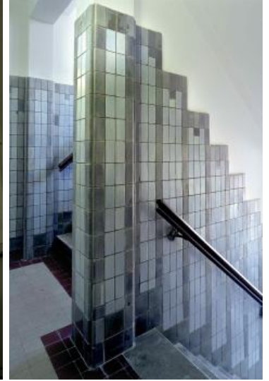
The Lloyd Hotel & Cultural Embassy, Amsterdam