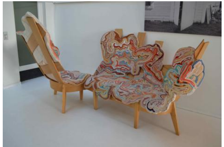
Bench by Tejo Remy and Rene Veenhuizen, The Lloyd Hotel & Cultural Embassy, Amsterdam

The front of the building contrasts hugely with the modern rear, retaining its 1920s style and layout. Tiled corridors, steep staircases and stained glass windows will impress architectural fans, enforcing the austere imprint of the former institution.