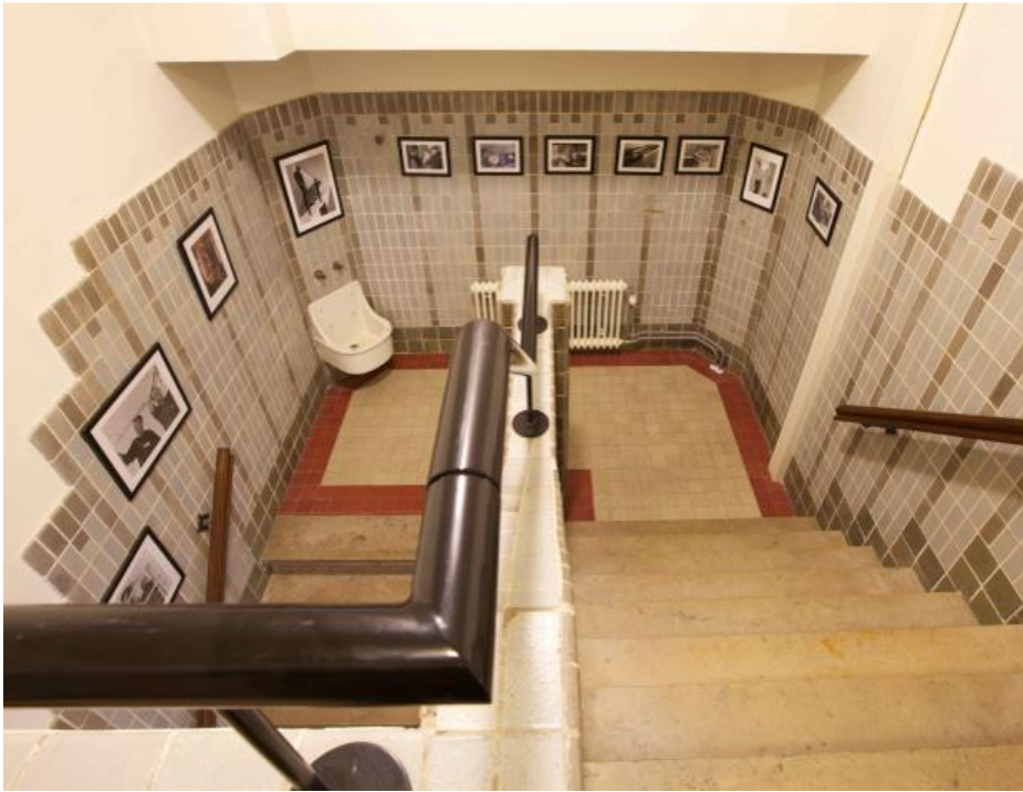
The Lloyd Hotel & Cultural Embassy, Amsterdam