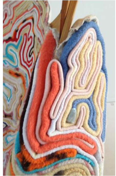
Bench by Tejo Remy and Rene Veenhuizen, The Lloyd Hotel & Cultural Embassy, Amsterdam