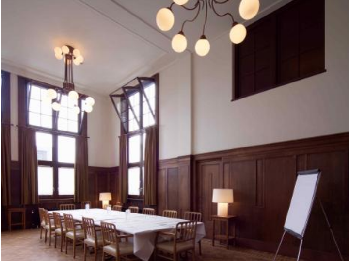
The Lloyd Hotel & Cultural Embassy, Amsterdam

original dimensions from the period when the building was a migrant's hotel, to huge loft spaces on the sixth floor (with a swing attached from the beams above), which can feel eerie and atmospheric, high in the building's rafters.