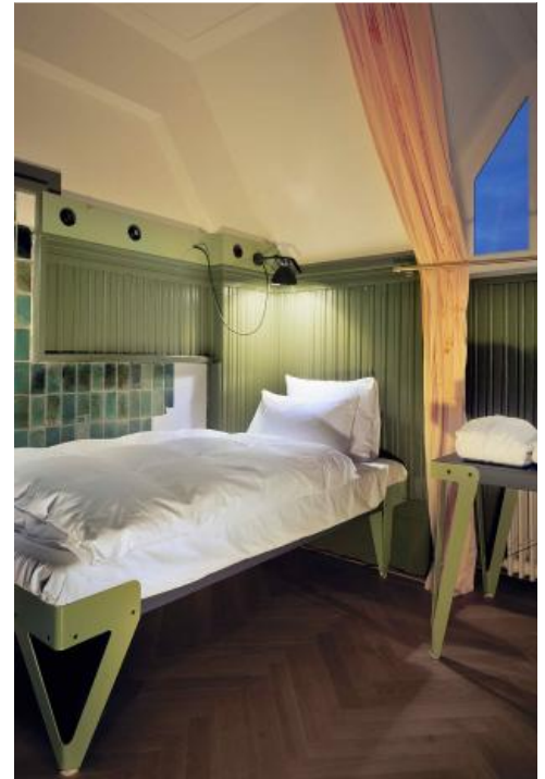
One-star room, The Lloyd Hotel & Cultural Embassy, Amsterdam

As the world's first hotel spanning one to five stars, the rooms are mostly categorised by size rather than comfort or style, so WGSN recommends choosing one of the Lloyd's concept-designed rooms for maximum wow-factor and comfort. Even better – ask to see the room before you book.