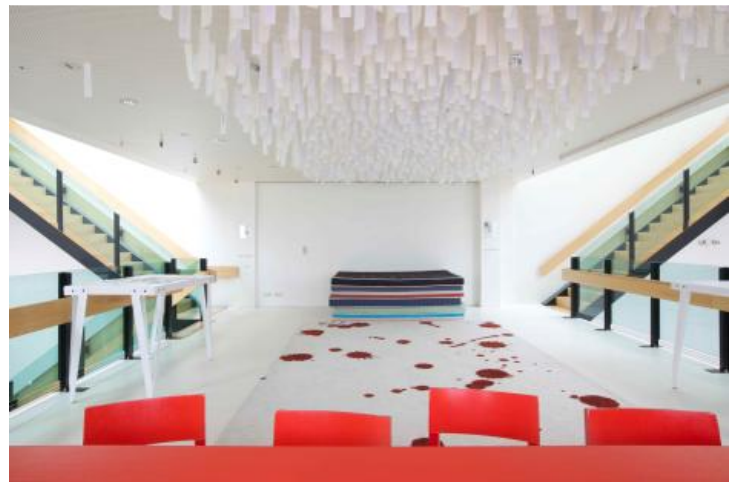
Communal area, The Lloyd Hotel & Cultural Embassy, Amsterdam

Impeccably-designed communal and gallery-style areas to the back of the building are entirely dedicated