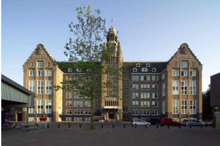
The Lloyd Hotel & Cultural Embassy, Amsterdam

This former migrant's hotel and detention centre has an austere architectural draw. Located in Amsterdam's emerging docklands area, it's the perfect vantage point to explore Noord Amsterdam.