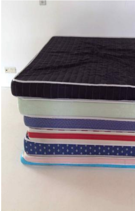
Art installation by Richard Hutten, The Lloyd Hotel & Cultural Embassy, Amsterdam

Sought-after function spaces within the embassy are perfect for creative client meetings. A programme of exhibitions, workshops, installations and furniture commissions add interest to the open mezzanine floors and library.