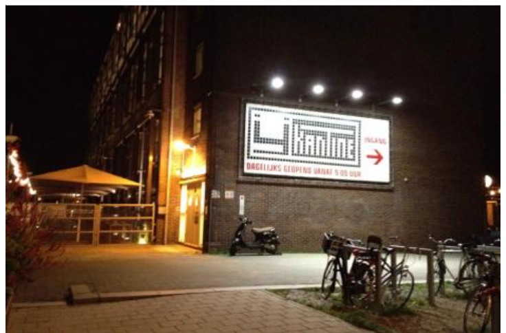
Kantine, Noord Amsterdam

An Art Nouveau style runs throughout the original accommodation areas of the building, which are interjected with ultra-modern communal areas and a large dining and gallery space at the centre.