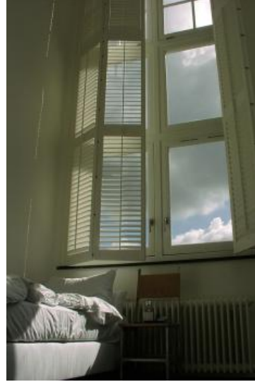
Four-star room, The Lloyd Hotel & Cultural Embassy, Amsterdam