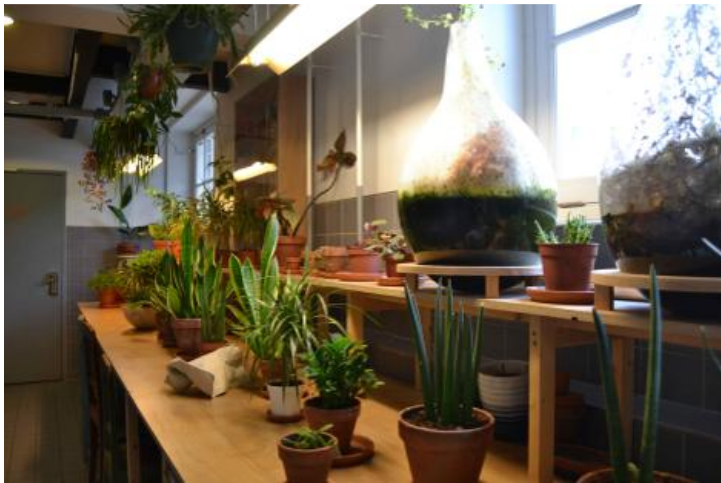
Art installation, The Lloyd Hotel & Cultural Embassy, Amsterdam