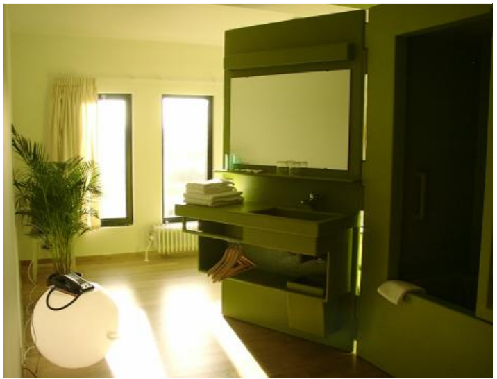
Room with Atelier Van Lieshout bathroom, The Lloyd Hotel & Cultural Embassy, Amsterdam

In rooms 602 and 607, exposed rafters and odd-shaped beds feature and feel entirely unique. On the fifth floor, interjected windows peer down into the hotel's cavernous communal restaurant. Bespoke Atelier Van Lieshout fibreglass bathroom units act as innovative room dividers, painted in vibrant yellow and green shades. Ask for rooms 220, 320, 420 or 520 to see this stunning architectural feature.