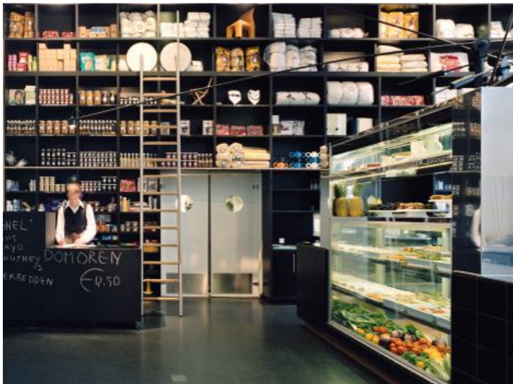
Restaurant, The Lloyd Hotel & Cultural Embassy, Amsterdam

In rooms 602 and 607, exposed rafters and odd-shaped beds feature and feel entirely unique. On the fifth floor, interjected windows peer down into the hotel's cavernous communal restaurant. Bespoke Atelier Van Lieshout fibreglass bathroom units act as innovative room dividers, painted in vibrant yellow and green shades. Ask for rooms 220, 320, 420 or 520 to see this stunning architectural feature.