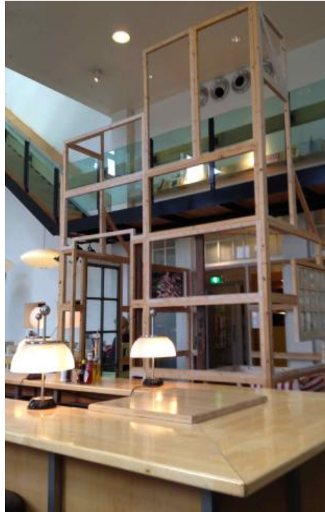
Installation by Chikako Watanabe, The Lloyd Hotel & Cultural Embassy, Amsterdam