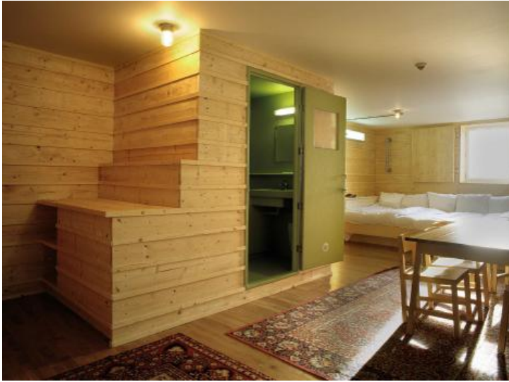
The Lloyd Hotel & Cultural Embassy, Amsterdam