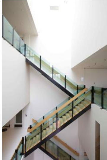
The Lloyd Hotel & Cultural Embassy, Amsterdam