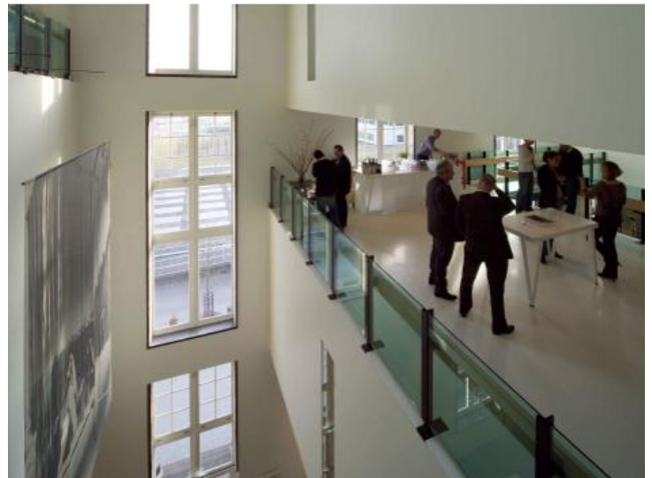
The Lloyd Hotel & Cultural Embassy, Amsterdam