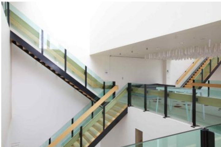
The Lloyd Hotel & Cultural Embassy, Amsterdam