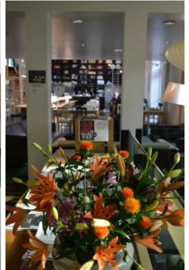
Restaurant, The Lloyd Hotel & Cultural Embassy, Amsterdam