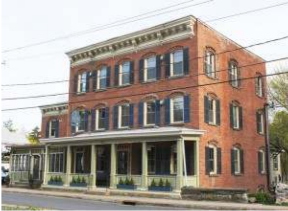
The 1850 House Inn & Tavern

The Union Street Guest House is located just one block over from Warren Street, Hudson's main thoroughfare, known for its creative boutiques, exciting cuisine, and tastefully curated antique shops. The guest house is comprised of a collection of spacious suites connected through a private courtyard. Each is appointed with an eye for design – incorporating a collection of vintage items like industrial sinks and mid-century artwork with modern, minimalist elements.