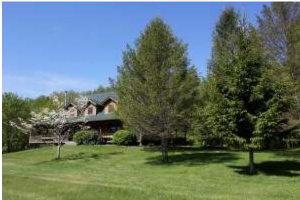
Mountain Horse Farm

The Roundhouse at Beacon Falls is a hotel, restaurant and bar located on a campus of reclaimed factory buildings in the center of the town's shopping district. The bold brick boxes are perched above a series of waterfalls that once provided hydroelectric power to the factories. The guest rooms – along with the grand dining room and bar – tell a visual story of rustic details and clean modern lines. The Roundhouse also features an immense event space with glass walls overlooking the falls.