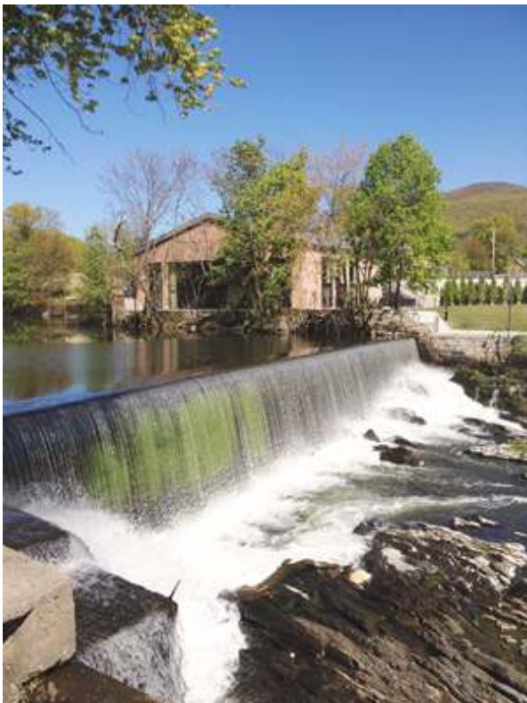
The Roundhouse at Beacon Falls