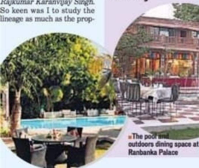
The pool and outdoors dining space at Ranbanka Palace

km away, Jodhpur being situated at the edge of Thar desert. Then there is Bisalpur, a village court built by Maharajadhiraj Ajit Singh 35km from Jodhpur, where you can mix around with the village folk in a rustic ambience.