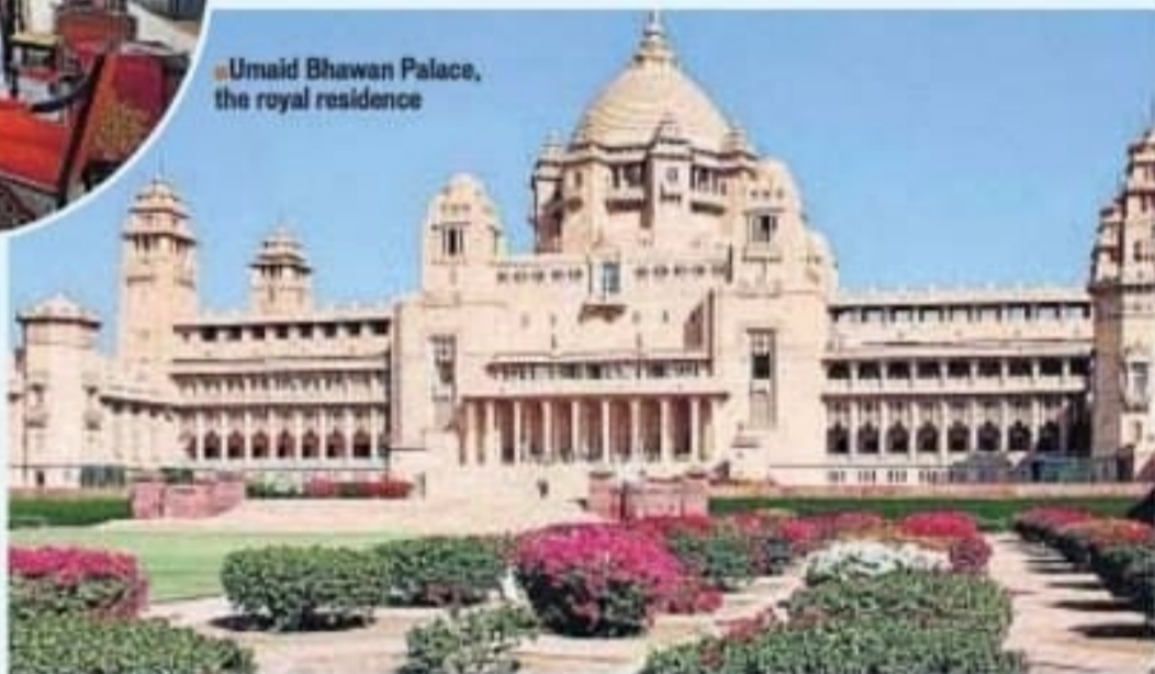
Umaid Bhawan Palace, the royal residence

There is not much to see in Jodhpur itself with the exception of the Umaid Bhawan Palace that is visible from Ranbanka Palace, and the Mehrangarh Fort, both of which are a mere twelve-minute drive from the hotel property. The hotel property does organise Desert Safari on request but that's around 60