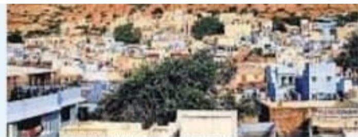
Towering above the blue city, Mehrangarh Fort