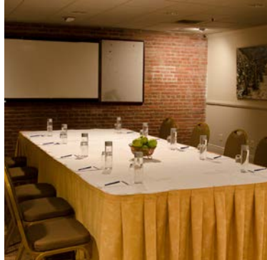
The Inn at Henderson's Wharf McClintock Room