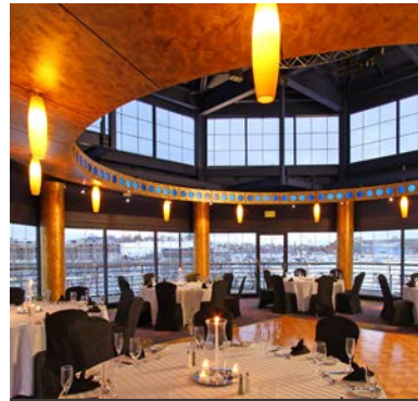
Pier 5 Hotel Waterfront Harbor Club