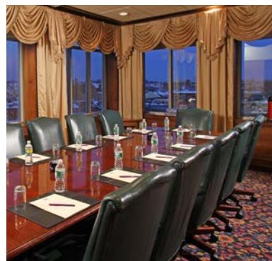
The Admiral Fell Inn Rooftop Captain's Boardroom