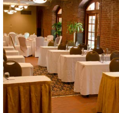
The Inn at Henderson's Wharf The Gallery