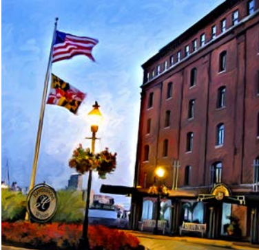
The Inn at Henderson's Wharf Fell's Point Hotel & Marina

web: www.HarborMagic.com blog: www.TravelGuideBaltimore.com www.Facebook.com/HarborMagicHotels