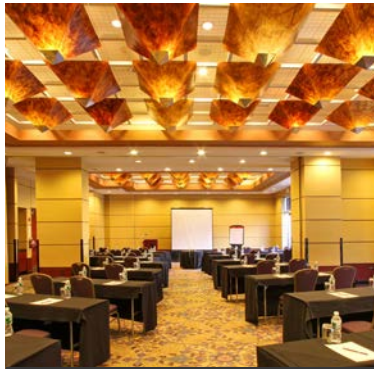
Pier 5 Hotel Harbor West Ballroom