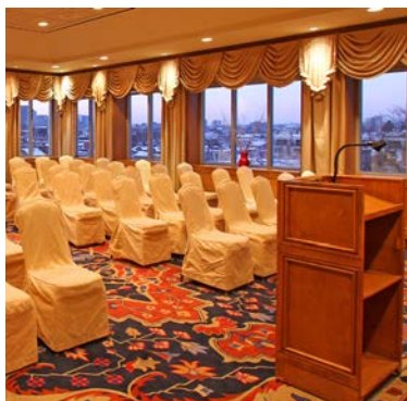
The Admiral Fell Inn Rooftop Admiral's Room