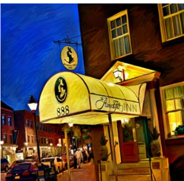
The Admiral Fell Inn Fell's Point Historic Hotel of America