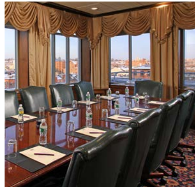
The Admiral Fell Inn Rooftop Captain's Boardroom