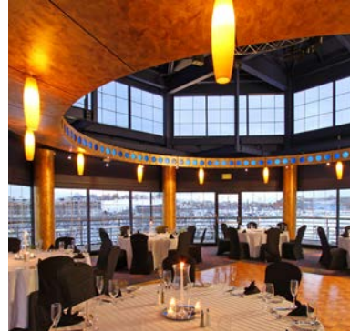
Pier 5 Hotel Waterfront Harbor Club