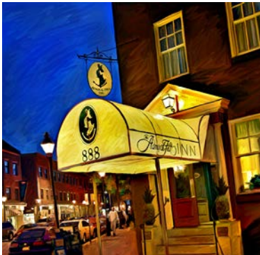
The Admiral Fell Inn Fell's Point Historic Hotel of America