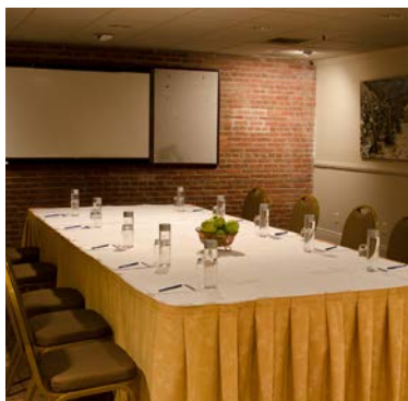
The Inn at Henderson's Wharf McClintock Room