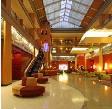
Pier 5 Hotel Lobby Atrium

web: www.HarborMagic.com blog: www.TravelGuideBaltimore.com www.Facebook.com/HarborMagicHotels