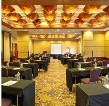
Pier 5 Hotel Harbor West Ballroom