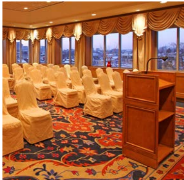
The Admiral Fell Inn Rooftop Admiral's Room