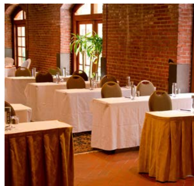
The Inn at Henderson's Wharf The Gallery