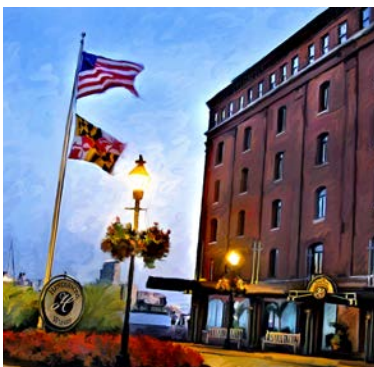
The Inn at Henderson's Wharf Fell's Point Hotel & Marina