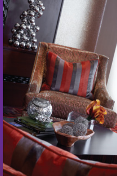
< CLUB LOUNGE SEATING