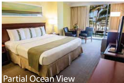
Partial Ocean View

Unwind with views of one of Aruba's most beautiful beaches.