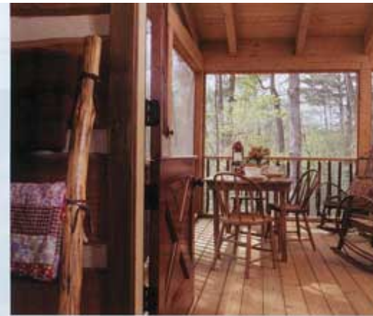
An old-fashioned Dutch door (left) leads to the screened back porch. The first floor master bedroom (below) has a distinctive Wisconsin floor with reusable covered logs and South-west style bedding.