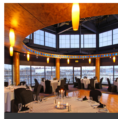
Pier 5 Hotel