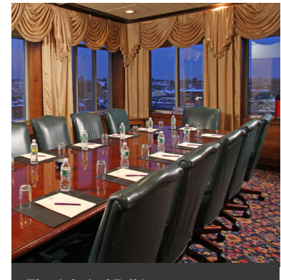
The Admiral Fell Inn