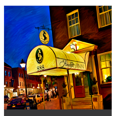
The Admiral Fell Inn