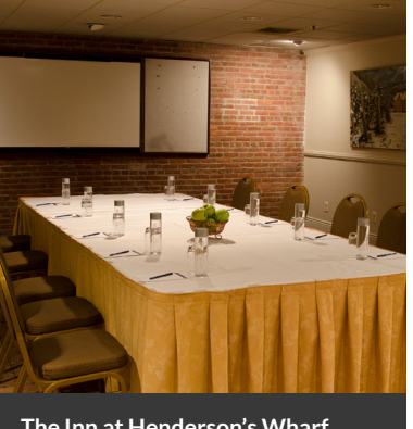
The Inn at Henderson's Wharf