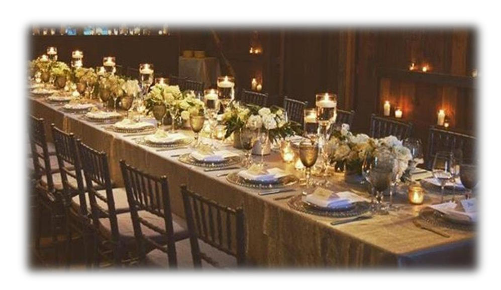
Holiday Dinner The Barn / The Studio