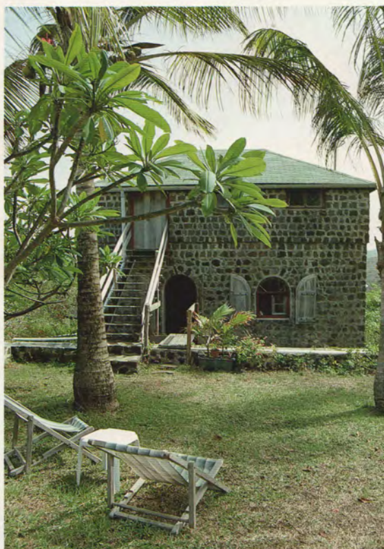
Guest rooms are in the stone house.