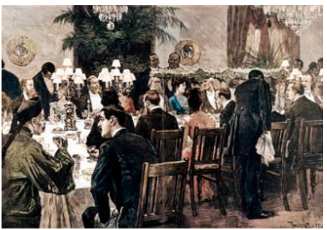
Above: President and Mrs. Cleveland host a State Dinner at the White House for the Diplomatic Corps, January 20, 1888.

The State Dining Room seats 120 people and must accommodate the official party and an equal number of administration people leaving space for 40 couples. Not many when you consider people who should be invited as well as people who would make for an interesting and entertaining evening.