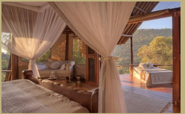
Whether you're interested in big cats or birding, the famous Maasai Mara will delight you with creatures great and small. Enjoy a bush walk and visit a Maasai market before winding down with a massage or spa treatment.