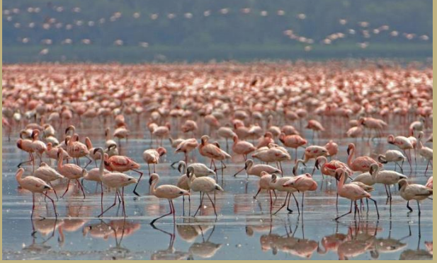
The Ngorongoro Conservation Area is a UNESCO World Heritage Site that features abundant wildlife and a volcanic crater dating back three million years. Take it in from a luxurious lodge where "Versailles meets Maasai."