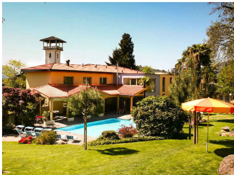
Youth Hostel Lugano – Savosa

Since 1941 the Majek-Wassmann family has been passionately managing the Lugano Youth Hostel, ranked as TOP within the Swiss Hostel Association's rating system. Located in Savosa, canton Ticino, Switzerland, the facility lies only 3 km away from the city center and remains easily reachable both through public and private means of transportation.